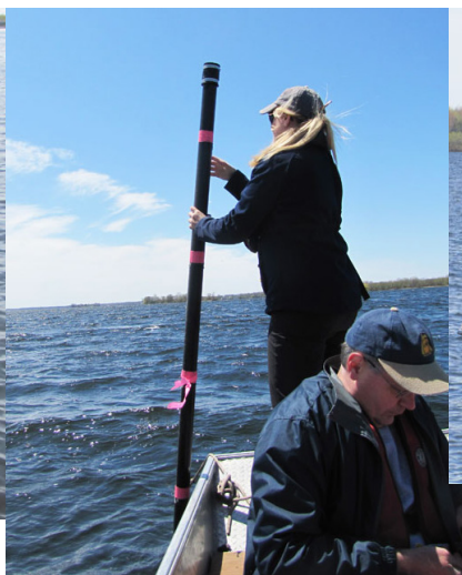
Taking a water sample.