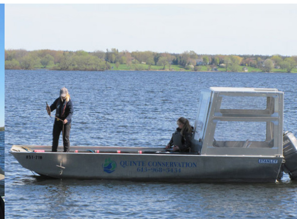
Measuring water clarity with a Secchi disk.